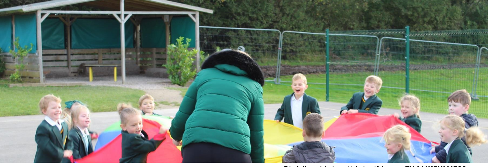
16th October 2020