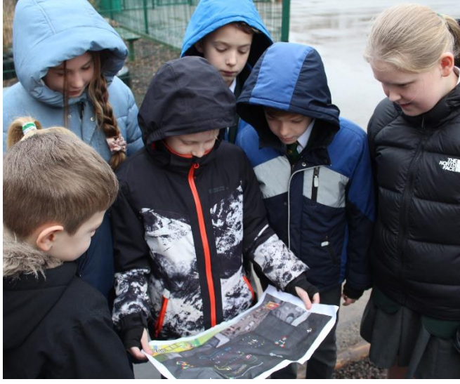
AFTER SCHOOL CLUB: A glimpse inside...Reception class focus in our after school club this half term.